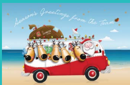
Quirky Team FE500, Gold Foil