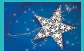
Shooting Star ST515, Silver Foil