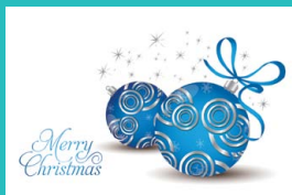
Moonlight Baubles BA694, Silver Foil