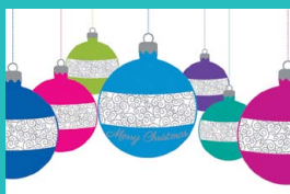
Glowing Baubles BA648, Silver Foil