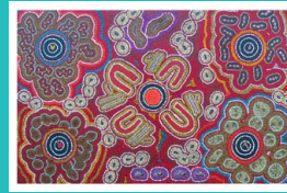
Dreamers by the Fireside AU622