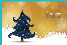
Dancing Tree TR654, Gold Foil