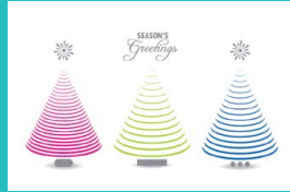
Trendy Trees TR621, Silver Foil