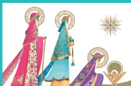
Magnificent Kings RE687, Gold Foil