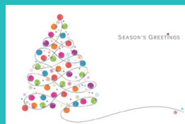
Swirling Tree TR662, Silver Foil