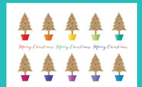
P petite Trees TR633, Gold Foil