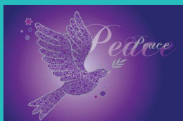
Dove of Peace DO690, Silver Foil