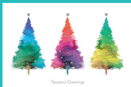
Watercolour Trees TR437, Silver Foil