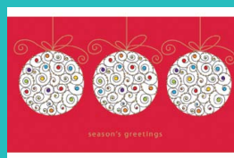
Colourful Baubles BA685, Gold Foil