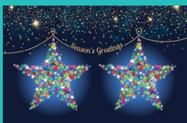
Twinkling Stars ST665, Gold Foil