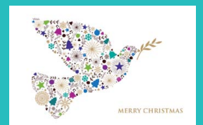
Magical Dove DO557, Gold Foil