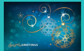
Stunning Baubles BA676, Gold Foil