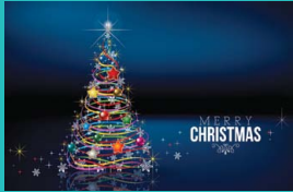
Vibrant Tree TR544, Silver Foil