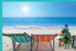
Christmas Holidays FE666