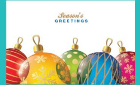
Sparkling Baubles BA663, Gold Foil