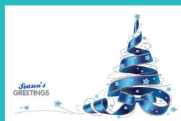
Gorgeous Tree TR555, Silver Foil