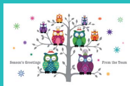
Christmas Hoot FE598, Silver Foil