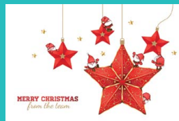
Santa's Wishes FE523, Gold Foil