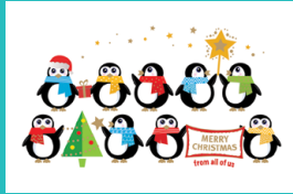
Cheeky Team FE17, Gold Foil